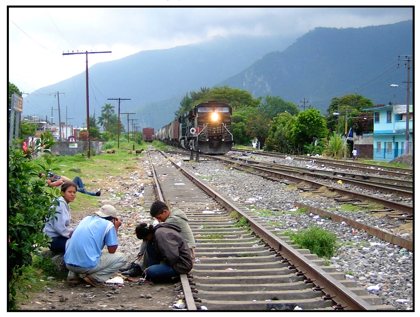
After a local migrant shelter was forced to close its doors in Orizaba, Veracruz, migrants must rest and wait along the train tracks where they are more vulnerable to violence and kidnappings.

Despite recent attention to the influx of Central American children arriving to the US-Mexico border, Central Americans—both children and adults—have been fleeing conditions of economic uncertainty and unimaginable violence for decades. A constellation of historical forces, including legacies of civil war, neoliberal restructuring, and transnational circulations of criminal violence propel their mobility. Yet, before reaching the deserts of Arizona or the waters of the Rio Grande, they must first cross Mexico, a paradoxical land of resource-rich natural and ethnic diversity, striking economic inequality and the center of a hemispheric war on drugs and trafficking.