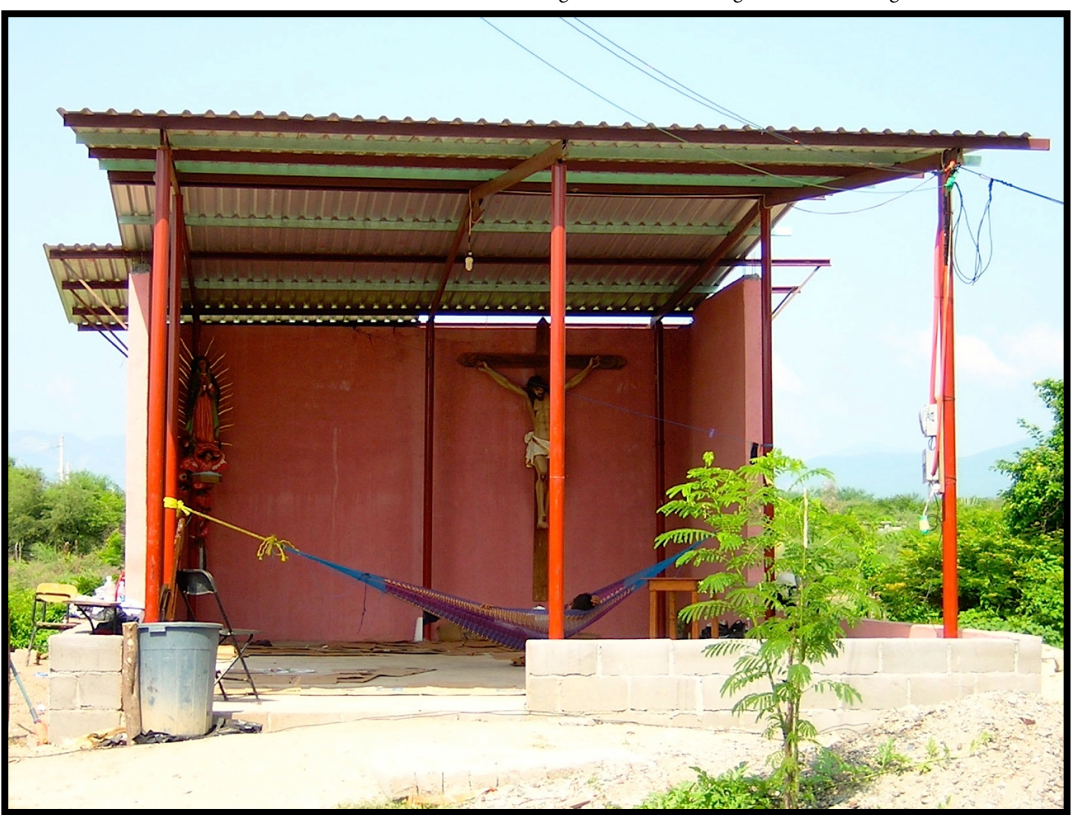
Vogt: The War on Drugs is a War on MIgrants