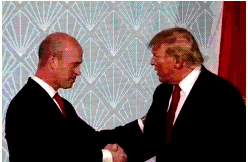
Heritage Foundation president Kevin Roberts – an architect of Project 2025 – shakes hands with former president Donald Trump, 4/21/22

Proposals in the Mandate for Leadership would severely inhibit the federal government’s protections around reproductive rights, LGBTQ rights, labor and civil rights, and immigration, as well as its climate change efforts. They would allow Trump to weaponize the justice system as his own personal retribution machine, gut the American system of checks and balances and purge the federal bureaucracy of experienced civil servants who don’t pledge fealty to Trump. On their own platforms, Project 2025 partners speak frequently in even more draconian terms.